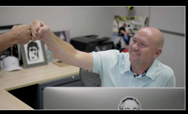
Rad Golf TV Segments