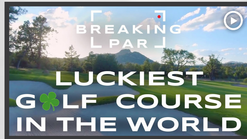
LUCKIEST GOLF COURSE IN THE WORLD