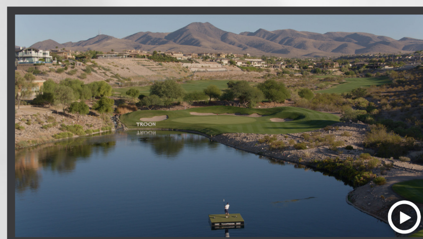
TEAM TROON CHALLENGE