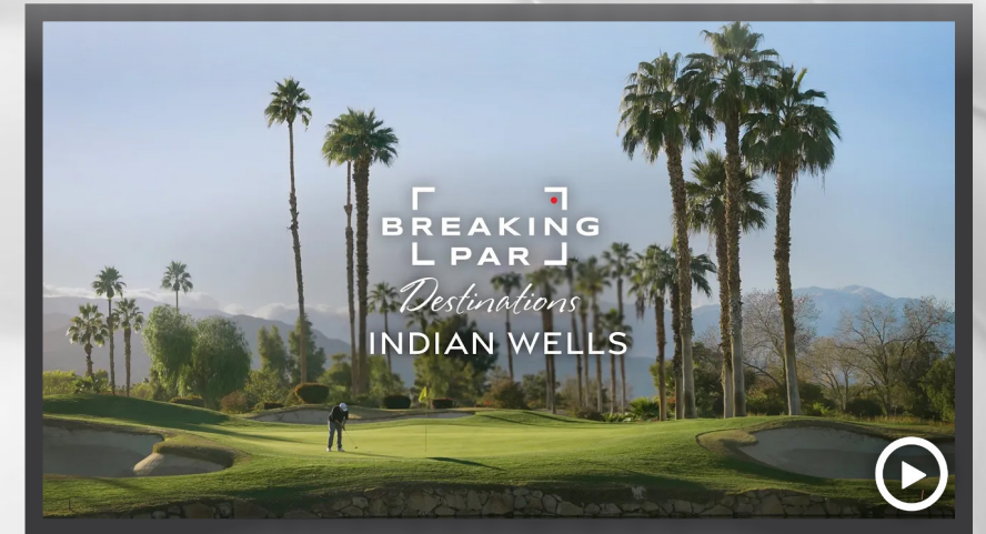
DESTINATION: INDIAN WELLS GOLF RESORT