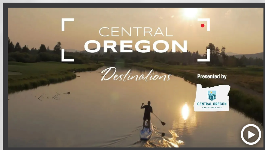
DESTINATION: CENTRAL OREGON